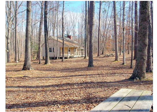
Outdoor Cabin Area – Pictured is the Lodge Building (one provided with each cabin unit).