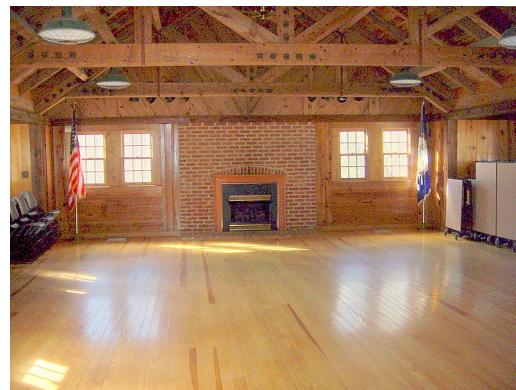
The interior (west end) of Swift Creek Banquet Hall.

The capacity of the Swift Creek Banquet Hall is 150. The capacity of the Powhatan Banquet Hall is 125.